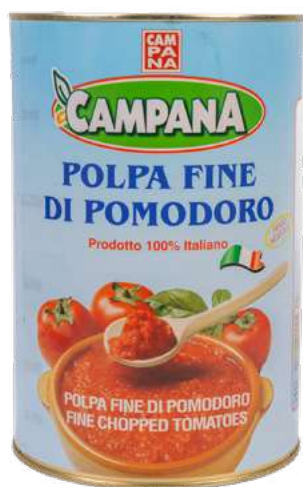
Fine Cut Tomato Pulp