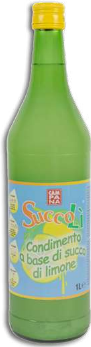
"Succoli" Lemon Juice Seasoning