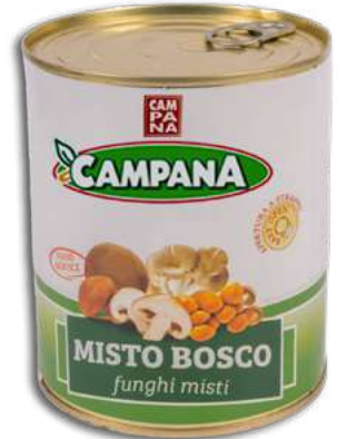
'Misto Bosco' Mixed Mushrooms in Oil