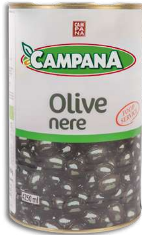
Pitted and Sliced Black Olives