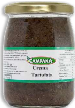
Truffle Cream in Oil