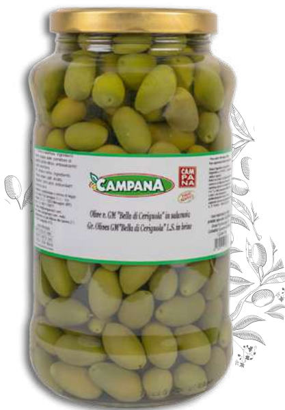
Green Olives GM "Bella di Cerignola" in Brine