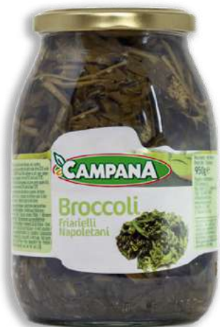
Friarielli (Neapolitan Broccoli) in Oil