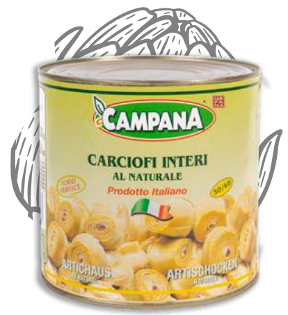
Natural Whole Artichokes