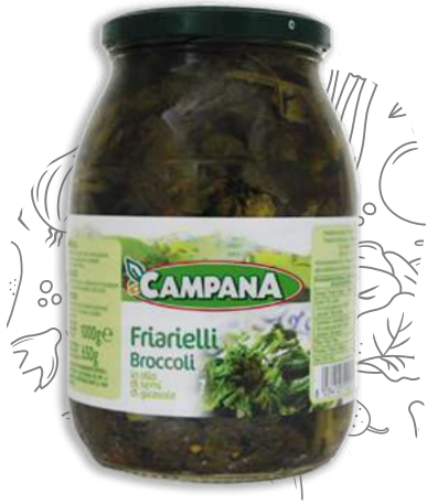
"Friarielli" Neapolitan Broccoli in Oil