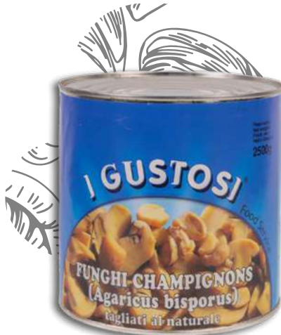
"I Gustosi" Natural 'Champignon' Mushrooms