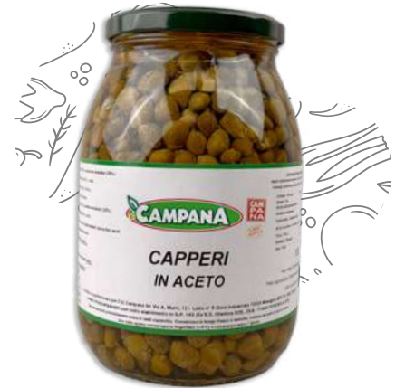
Small Capers in Wine Vinegar