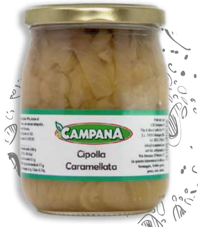
White Caramelized Onion