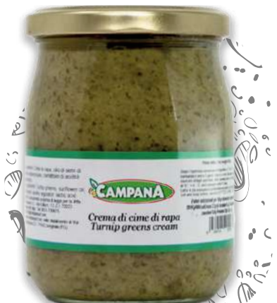
Turnip Greens Cream in Oil