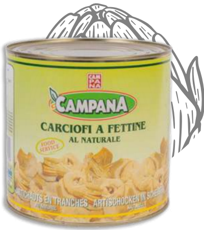
Sliced Natural Artichokes