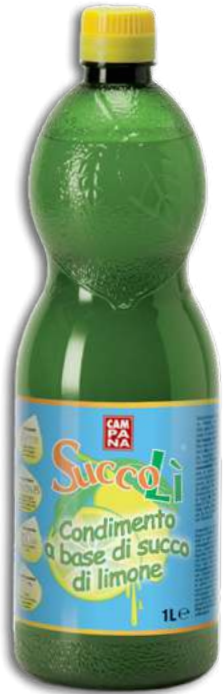
"Succoli" Lemon Juice Seasoning PET