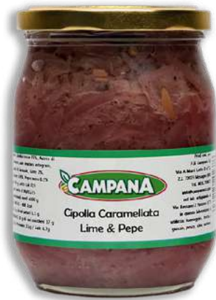
Caramelized Onion Lime & Pepper