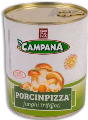
'Porcinpizza' Sautéed Mushrooms in Oil