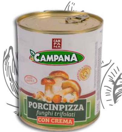
'Porcinpizza' Sautéed Mushrooms in Oil with Cream