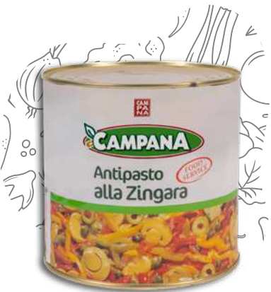
"Antipasto alla Zingara" in Oil