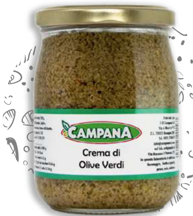
Green Olive Cream in Oil