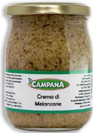
Eggplants Cream in Oil