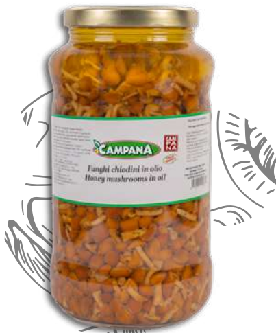
Honey Mushrooms in Oil