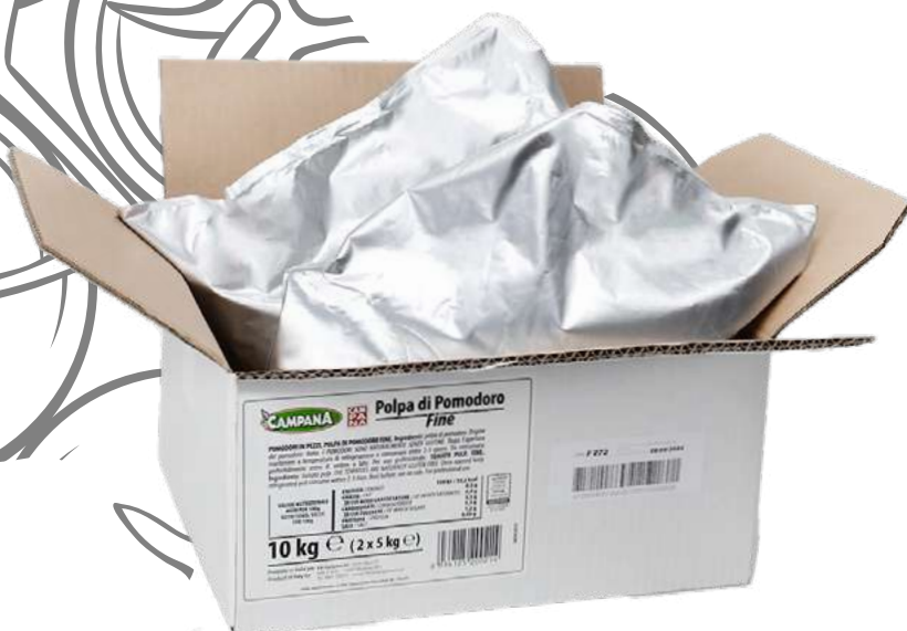
Fine Cut Tomato Pulp Fine 5KG X2