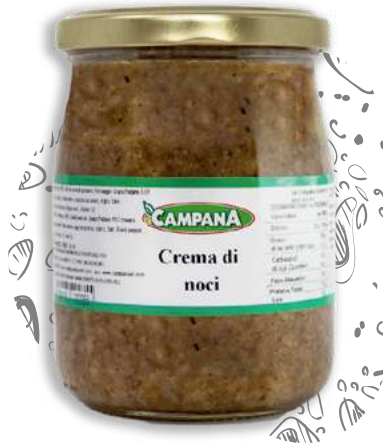
Nuts Cream in Oil