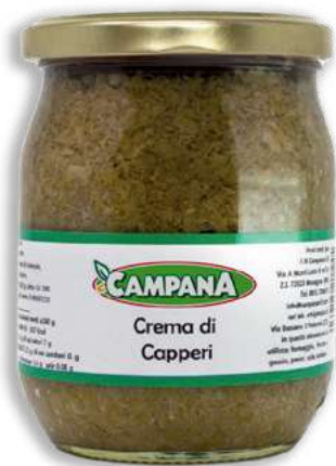
Capers Cream in Oil