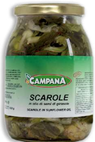
Seasoned Escaroles in Oil