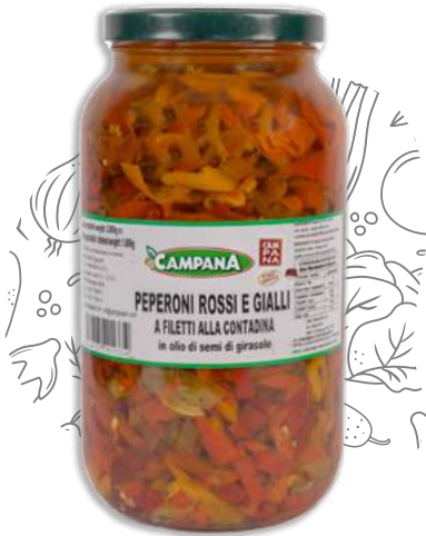
Red and Yellow Sliced Peppers "alla Contadina" (paesant style)