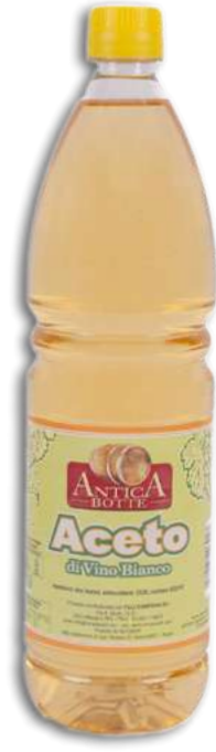
"Antica Botte" White Wine Vinegar