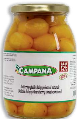
Natural Yellow 'Datterino' Tomato "Baby Goloso"