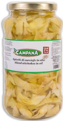
Artichoke Wedges in Oil