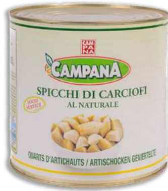
Natural Artichoke Wedges