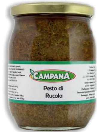
Rocket Pesto in Oil