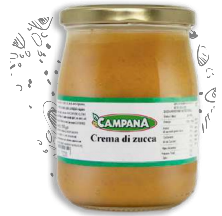
Pumpkin Cream in Oil