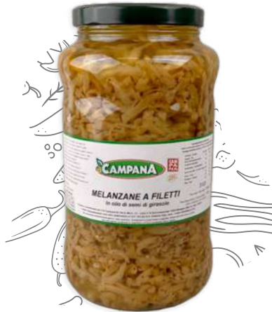
Sliced Eggplants in Oil "alla contadina" (paesant style)