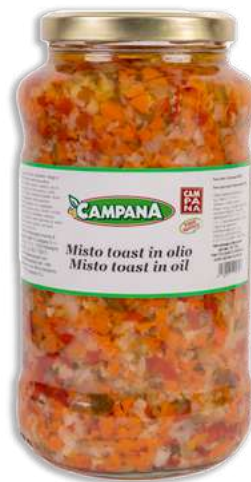
Mixed Toast in Oil