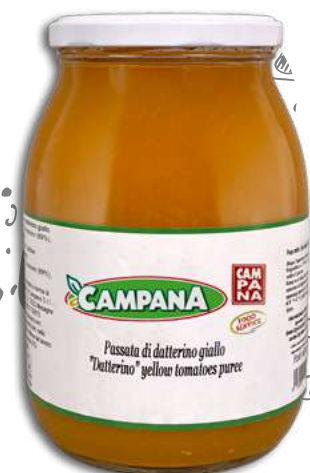
Yellow 'Datterino' Tomato Passata