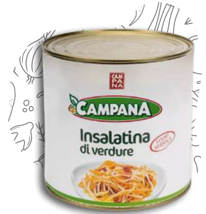
Natural Vegetables Salad