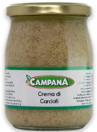
Artichokes Cream in Oil