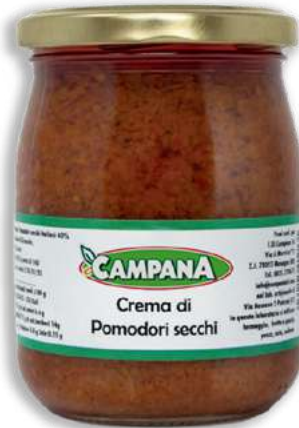
Dried Tomatoes Cream in Oil