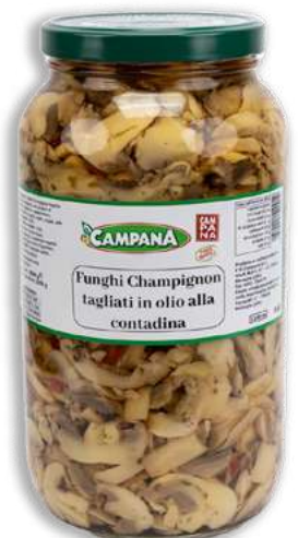
Cut 'Champignon' Mushrooms in Oil "Alla Contadina" (paesant style)