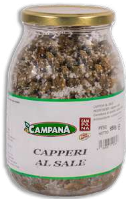
Capers in Salt