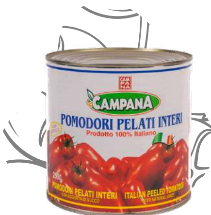
Whole Peeled Tomatoes