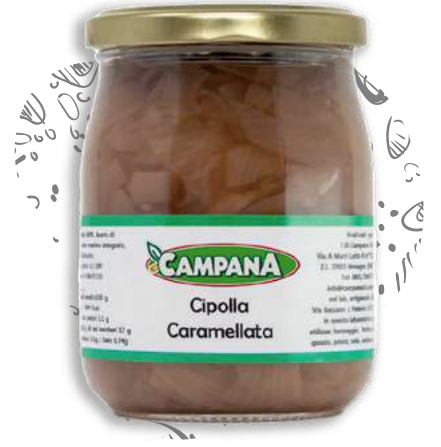
Red Caramelized Onion