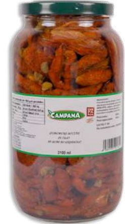
Dried Tomatoes in Oil "alla contadina" (paesant style)