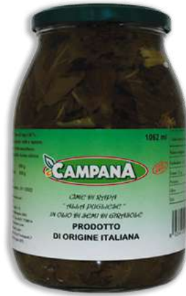
Turnip Greens "Alla Pugliese" in Sunflower Oil