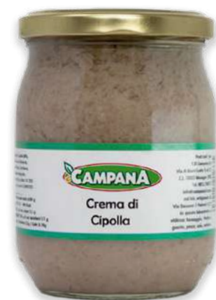
Onion Cream in Oil