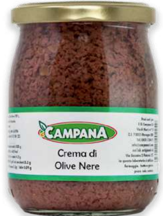
Black Olives Cream in Oil