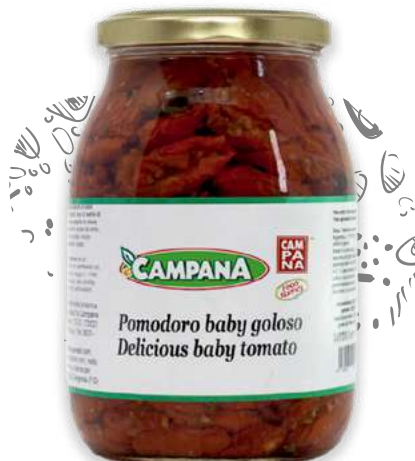
Semi-dried Tomatoes "Baby Goloso" in Oil