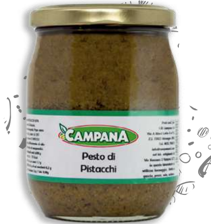
Pistachio Pesto in Oil