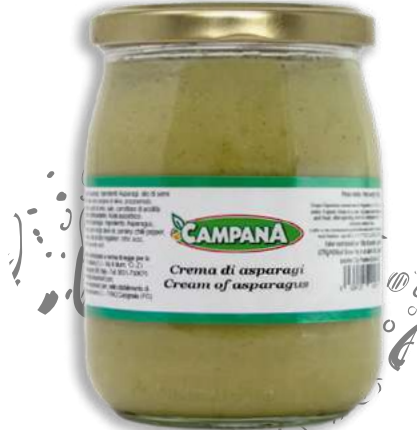
Asparagus Cream in Oil