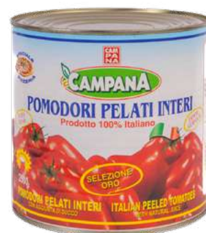
Whole Peeled Tomatoes Gold Selection