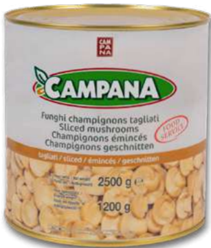
Natural Cut 'Champignon' Mushrooms