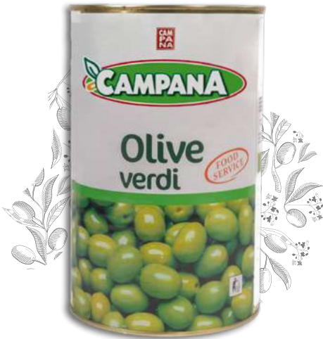
Pitted and Sliced Green Olives