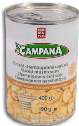
Natural Cut 'Champignon' Mushrooms