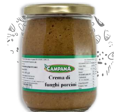
Porcini Mushroom Cream in Oil