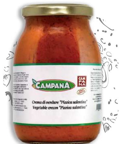
Vegetable Cream "Pizzica Salentina" in Oil