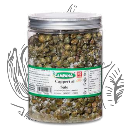
Capers in Salt - Plastic Packaging