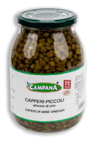
Small Capers in Wine Vinegar